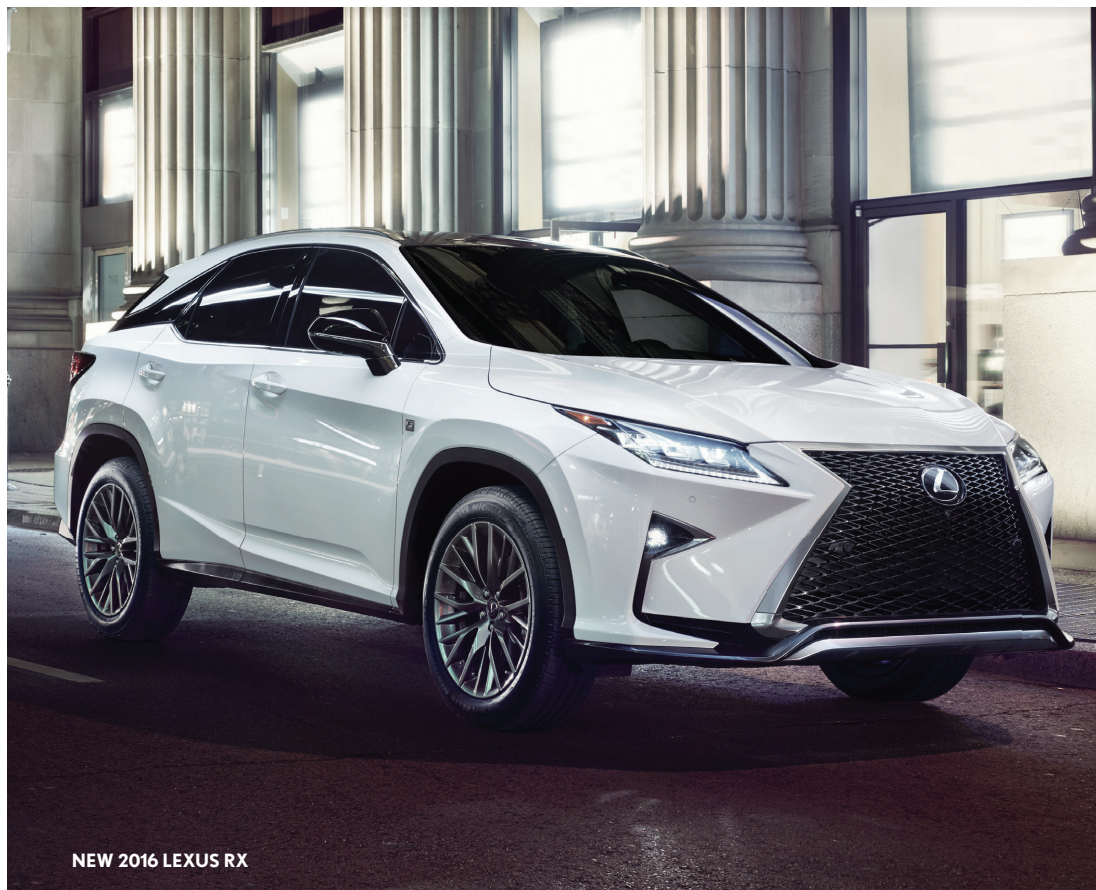
NEW 2016 LEXUS RX