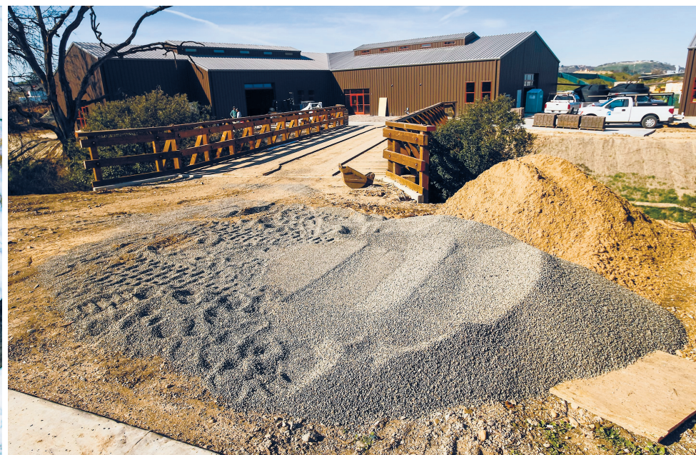
Far left, a signpost at Tin City. Above, construction continues. Below left, is BarrelHouse Brewing Co.